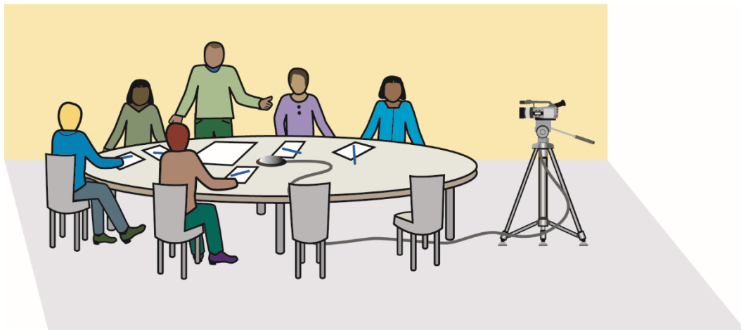
View of a small group showing best camera and microphone placement